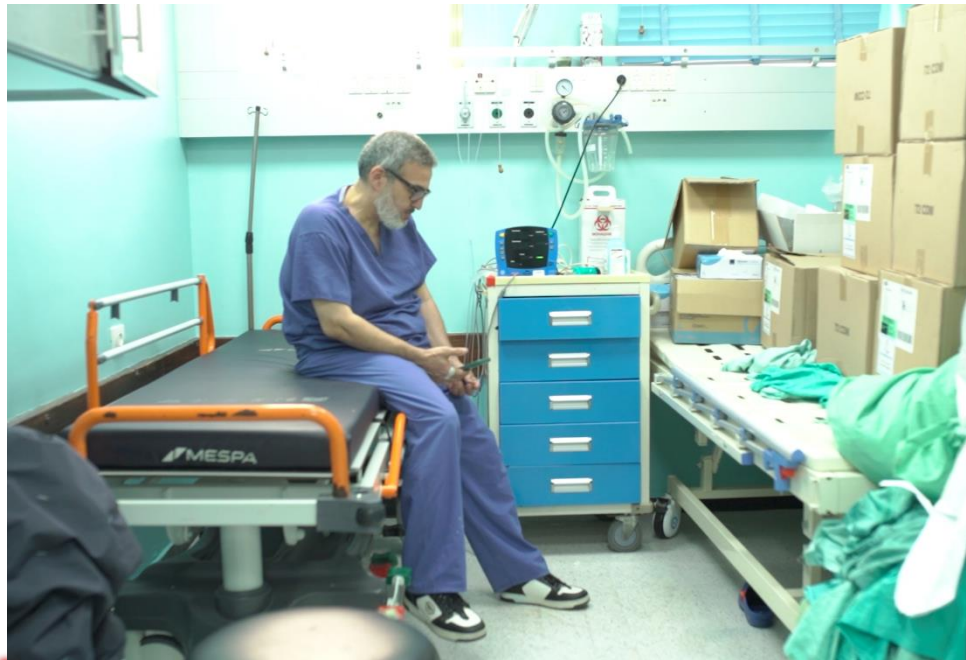
A State of Passion: Al-Shifa Hospital, Ghassan takes a break between surgeries