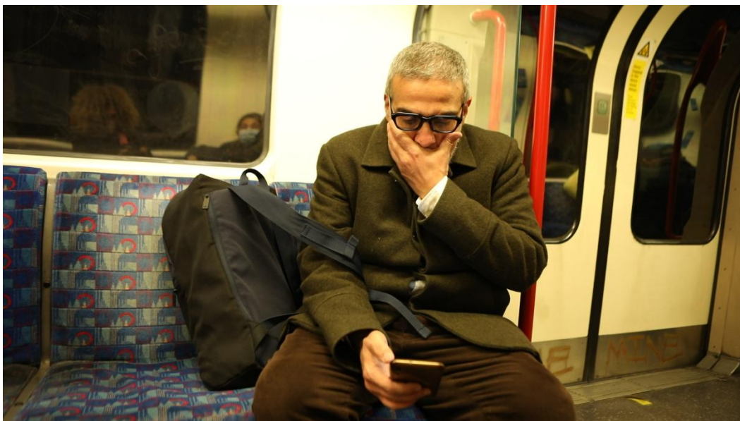
A State of Passion: Ghassan receives the news that his friend and colleague has been shot